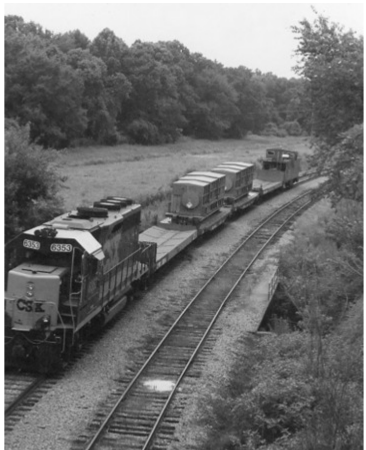
FUEL TRAINS IN OPERATION EARLY 2000'S.

The nuclear fuel casks were designed to safely carry spent fuel assemblies with no radiation leakage, and to withstand damage that might occur from a derailment, impact from other rail equipment or a vehicle at a grade crossing. The cask itself can be rotated upwards 90 degrees for loading and unloading the spent fuel assemblies within a secure location inside a nuclear plant. (Continued on page 3.)