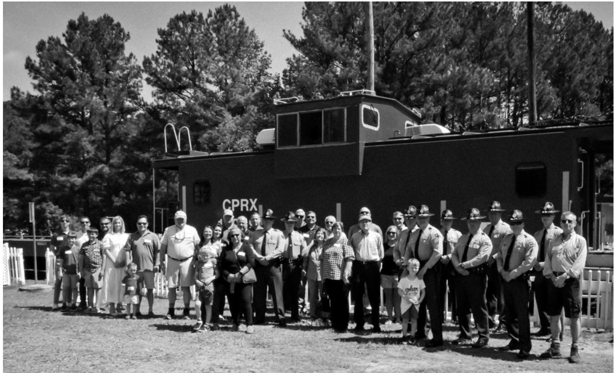
MAY 20, 2023 WAS A BRIGHT DAY FOR OUR GUESTS AND THE ELEVEN FUEL TRAIN VETERANS - Caboose looked beautiful for our guests which included the veterans, their families, friends, and several North Carolina State government dignitaries with their families.

After the recognition presentation, the veterans were able to board the two escort cabooses set up in a train with two of the actual idler flat cars as our “simulated nuclear fuel train.” A second train also departed with family members, guests, and others to meet at the north end of our line for a run by of the two trains. Lots of smiles, waves, and photos taken. Plus, some great drone footage.