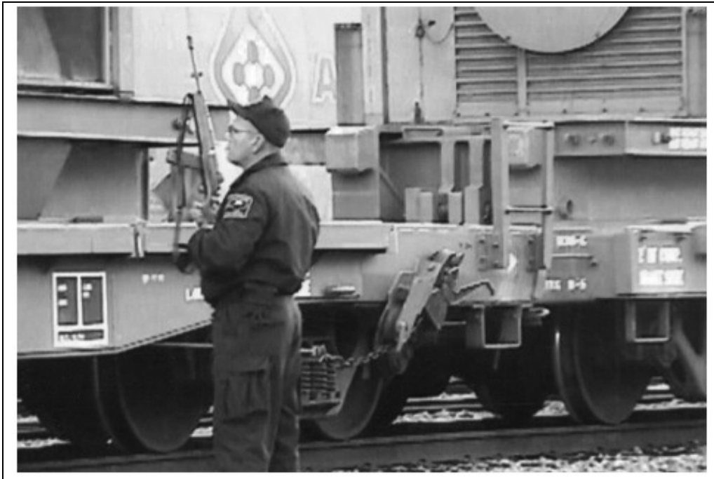
FUEL TRAIN SECURITY TEAM MEMBER IN THE 1990'S

The utility offered to donate three AR-15s to the NC SHP. It had to go all the way up to the North Carolina Attorney General's office to get approval for the Highway Patrol to accept the rifle donation. Whenever the fuel trains ran after that, there were always three AR-15s onboard (plus other Patrol weapons).