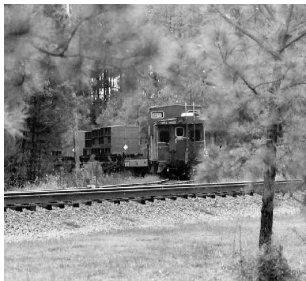
FUEL TRAIN WITH ESCORT CABOOSE CPRX 10009 - Leaving CSX line and proceeding down siding about two miles to the Harris Nuclear Power Plant in the early 2000's.

The spent nuclear fuel trains ran between 1989 and 2008. Their purpose was to move spent nuclear fuel rod assemblies stored in cooling pools at one plant to another plant with more cooling pool capacity for "interim storage." These trains started running before onsite dry fuel storage was a viable option and then continued as a safe, and more cost-efficient alternative to onsite dry storage. The initial operations between 1989 and 1995 focused on moving 304 spent nuclear fuel assemblies from the Robinson Nuclear Plant (RNP) in South Carolina to the Brunswick Nuclear Plant (BNP) in North Carolina. Starting in 1995 and until 2008, the spent nuclear fuel was all shipped from RNP (504 assemblies) and BNP (4,397 assemblies) to the Harris Nuclear Plant (HNP) located twenty miles southwest of Raleigh, NC. HNP was the newest of the three plants and built with far more spent fuel storage capacity. (See map on next page.) The trains were discontinued in 2008 to preserve storage space for future needs at HNP.