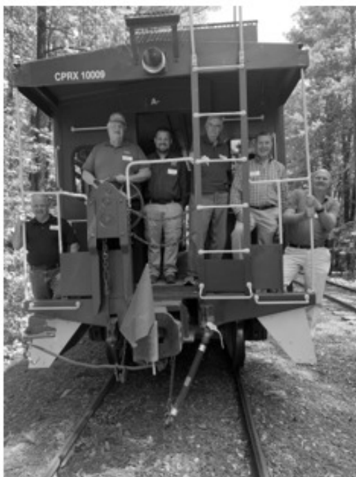
ELEVEN FUEL TRAIN VETERANS ONBOARD CPRX 10002 AND 10009 – May 20, 2023, Inaugural run on the NCRM’S New Hope Valley Railway.