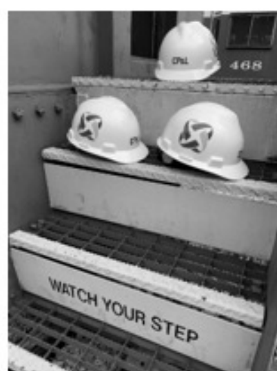
UPGRADES AND HISTORICAL TREATS, ALL INTACT – CPRX10002 came ‘well-stocked’.

In April 2002 it was inspected and serviced by CSX for CP&L. It was painted and renumbered CPRX 10009. Upgrades by CP&L contractors included a new diesel generator, electrical system, backup battery system, two RV style HVAC units, Microphor railroad toilet, four air suspension seats, and radios for CP&L and NC SHP. Other modifications included removal of the original railroad stove and smokestack. A long storage area with a padded bench on top, desks with storage, and a large metal cabinet was installed for more storage space. Other installed items were a refrigerator, chilled water dispenser, and microwave.