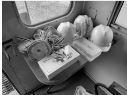
CPRX 10002 INTERIOR - As originally found Nov 2019, and curating contents after moving May 2022.

We believe the very last fuel train run for CPRX 10002 was in 2007, It was subsequently moved to HNP around 2016 where it was to be scrapped. Remarkably, when the NCRM first visited it at HNP in late 2019, much of the contents left by the last fuel train crew were still inside. Nothing had been disturbed after the last crew left and locked it up. These included Fig Newtons left behind in the refrigerator (which still looked edible given what must be amazing preservatives).