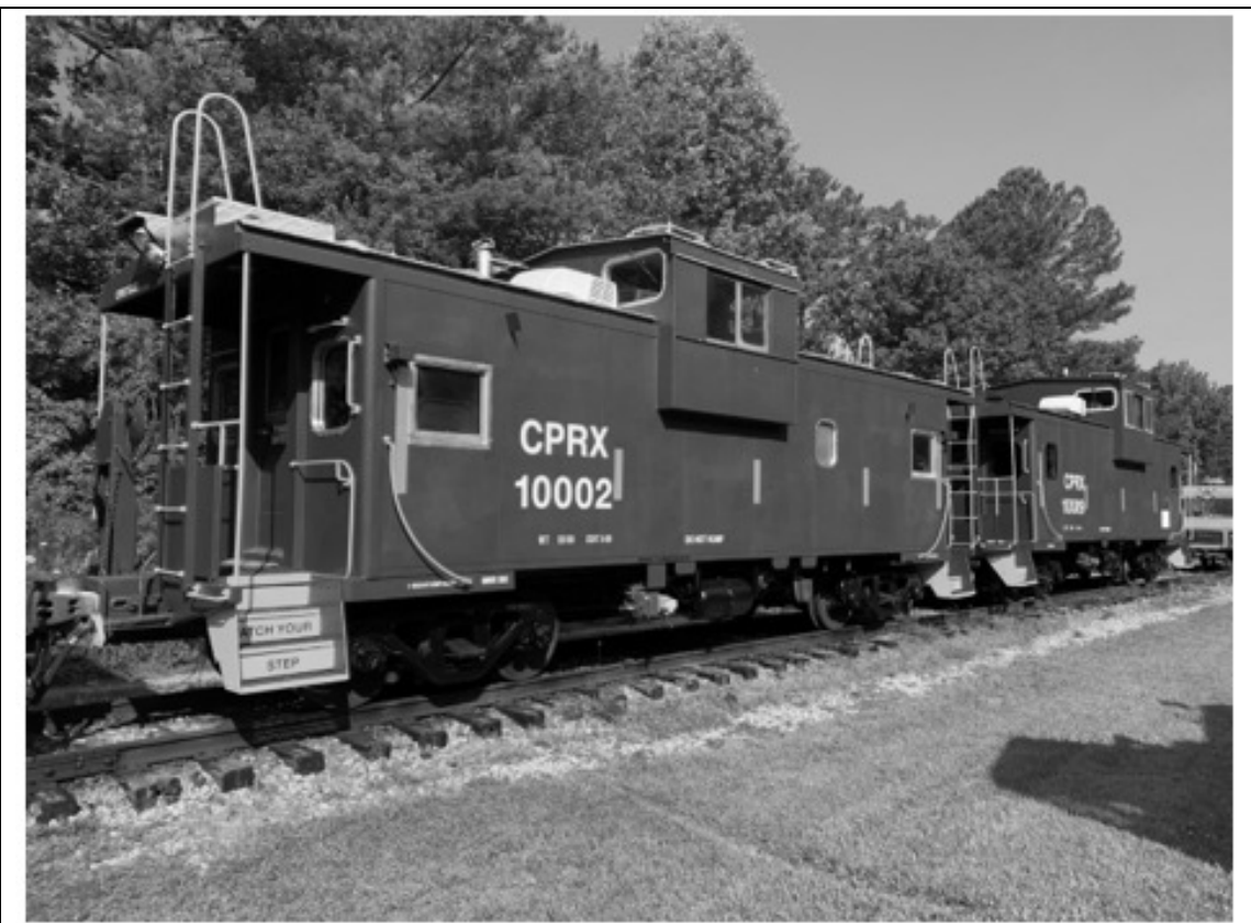
NUCLEAR FUEL TRAIN ESCORT CABOOSES - CPRX 10002 & 10009 after restoration, May 2023.

Nuclear fuel and weapons trains still use escort vehicle cabooses today. The designs are far more sophisticated than CPRX 10002 and 10009. See an example of a modern escort caboose at the link below. https://www.energy.gov/ne/articles/rail-escort-vehicle-fact-sheet