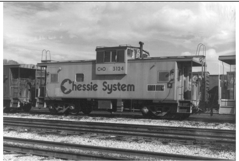
C&O 3124