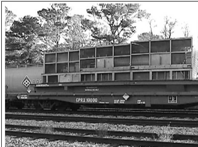
CPRX 1000 NUCLEAR FUEL CASK FLAT CAR IN THE 1990'S.

FUEL TRAIN NUCLEAR FUEL CASK CARRYING FLAT CARS, EARLY 2000's.